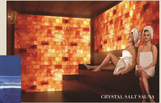
CRYSTAL SALT SAUNA

A well designed development where the unique facilities have been thoughtfully created to provide you and your family the enjoyment for your leisure pleasures.