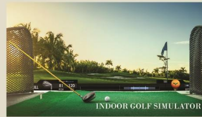
INDOOR GOLF SIMULATOR