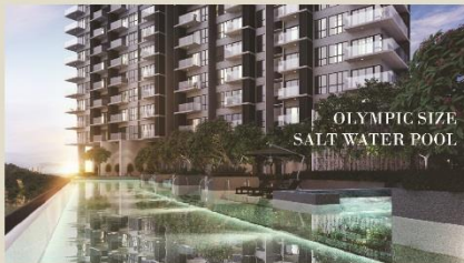
OLYMPIC SIZE SALT WATER POOL

The serene greenery in an unexpected enclave of nature welcomes you home to the luxury living lifestyle, towering the prestigious address of Country Heights Damansara. A much sought after location with amenities where education, healthcare, shopping, recreation and expressway connections are within a stone's throw away.